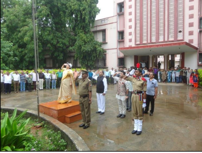
માણસા કોલેજ કેમ્પસ

(૧૫મી ઓગસ્ટ ૨૦૧૯ સ્વતંત્રતાદિન નિમિત્તે ધ્વજવંદન કાર્યક્રમ)