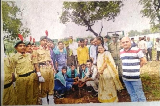
भाषासा | शेठ अेल.अय.सायन्स कोलेज, भाषासा