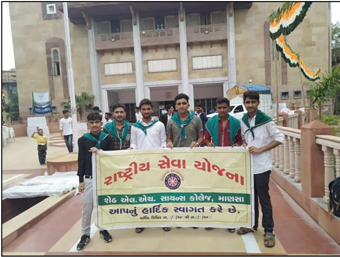
ગુજરાત યુનિવર્સિટી કેમ્પસ અમદાવાદ