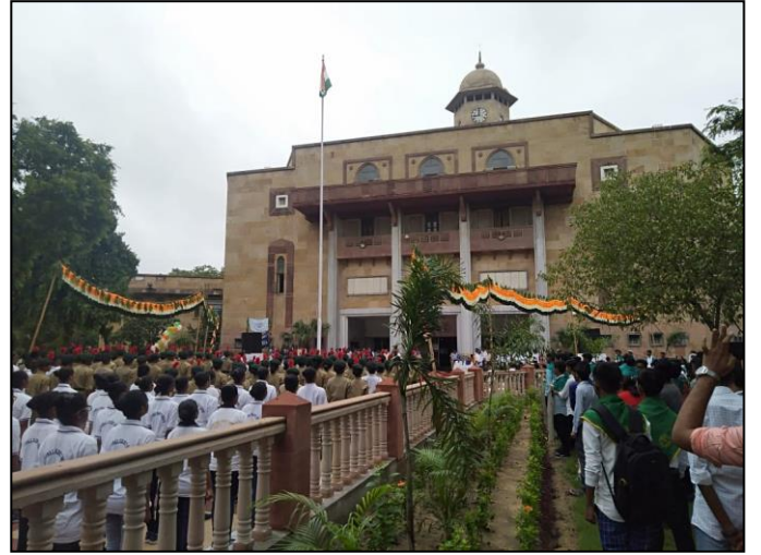
ગુજરાત યુનિવર્સિટી કેમ્પસ અમદાવાદ