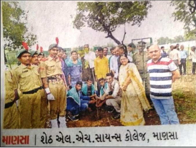
भाषासा | शेठ भेल.अेय.सायन्स कोलेज, भाषासा