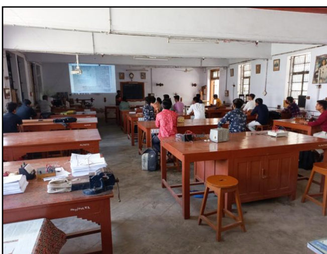
Topic: Optical Fiber

Note: Student Prepare power point presentation, video, Material and use projector of Physics Department for seminar.