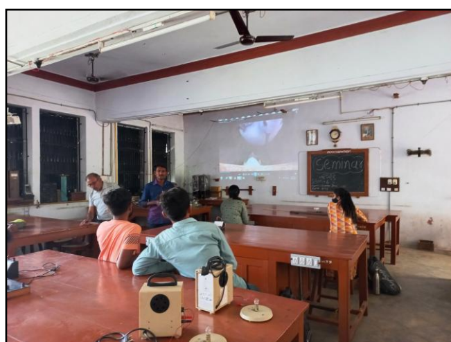
Topic: Motivation Speech